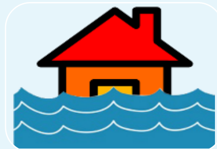
Sea levels rising