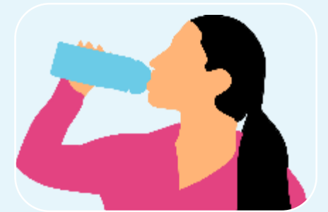
Changes to our water supplies